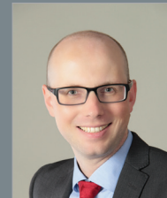
RETO MERGES GLOBAL HEAD OF EXPANDING PRECISION MEDICINE SIEMENS HEALTHINEERS

Current and future advances in diagnostics and personalized therapies, in conjunction with powerful artificial intelligence, are the key elements to expanding precision medicine—enabling consistent delivery of high value care.