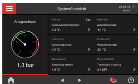
Large colour touchscreen display for a central source of information