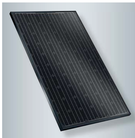
Monocrystalline photovoltaic module Vitovolt 300 with black anodised frame and dark Tedlar film