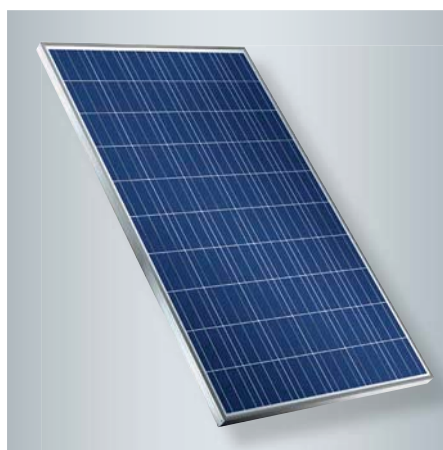
Polycrystalline photovoltaic module Vitovolt 300 with 48 or 60 cells in a compact design