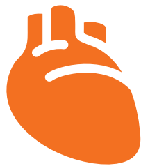
Infections of the Immunosuppressed