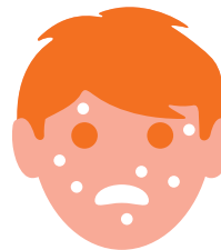
Fever, Rash, Childhood Infections