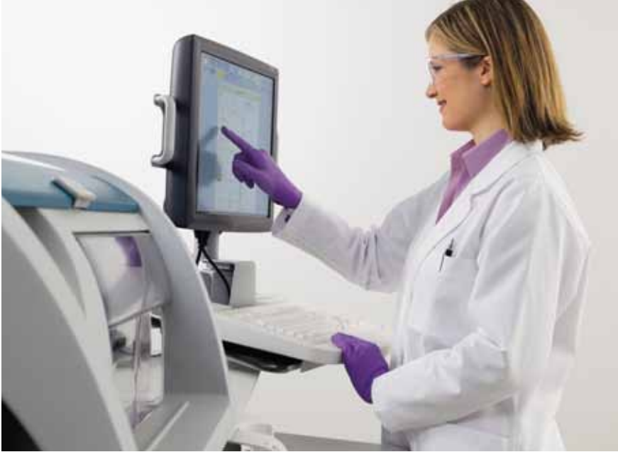
The BRAHMS PCT test is available on the Siemens ADVIA Centaur XP and ADVIA Centaur CP Immunoassay Systems.*