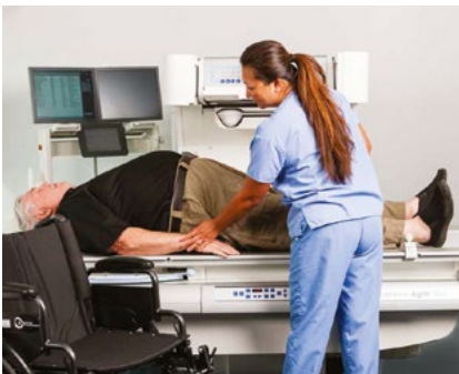
High table weight capacity

The MAX family provides one of the most agile systems in the world for imaging those with mobility challenges. Now, for many tests, you can allow patients to remain comfortably seated in their wheelchairs, while providing state-of-the-art X-rays and shortened procedure times.