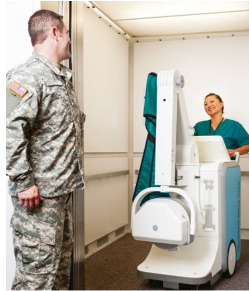
For Mobile X-ray Mobilet Mira Max

MAX detection applies intelligent innovation at every step, making comprehensive imaging easier. With features like MAX wi-D and MAX mini, you'll have advantages like our lightest wireless detector for easier handling and the right size table detector for exams in orthopedics, pediatrics, trauma, and more.