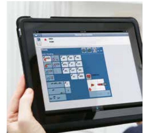
Remotely manage your POC devices with your tablet.

You can't be everywhere all of the time, and now you don't have to be. With the RAPIDComm Web Application, you can quickly view the status of your POC instruments and troubleshoot issues—even from a handheld device. For blood-gas analyzers, you can even remotely view and control instruments, regardless of where they are located or wherever your busy day takes you.