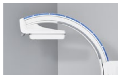
f) Mobile C-arm: FD from top, front to bottom