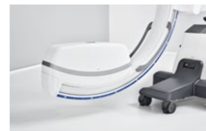
j) C-arm: single tank from top to bottom