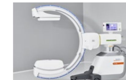
o) Mobile C-arm: outer rail surfaces and cabling