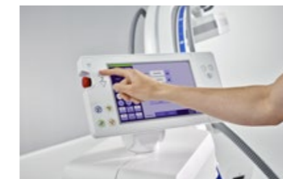
k) If possible, lift C-arm vertically with motorisation.