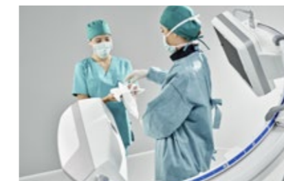
i) C-arm: inner surface