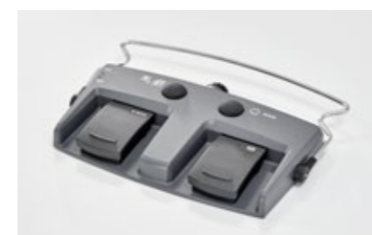
l) Wireless / wired footswitch