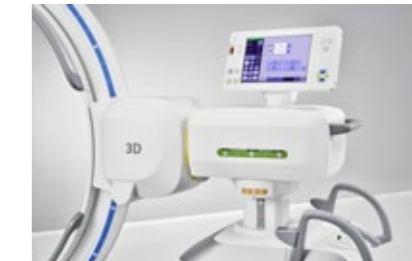
n) Lifting column of the C-arm