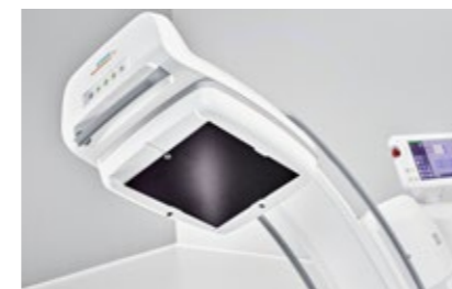
h) Mobile C-arm FD (bottom)