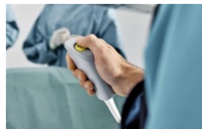
c) Mobile C-arm: handswitch