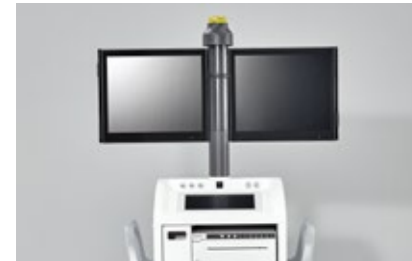
a) Monitor cart: display, mouse and handles

Use wet or impregnated dry wipes to disinfect the following surfaces, in the following order: