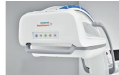
g) Mobile C-arm FD (front)