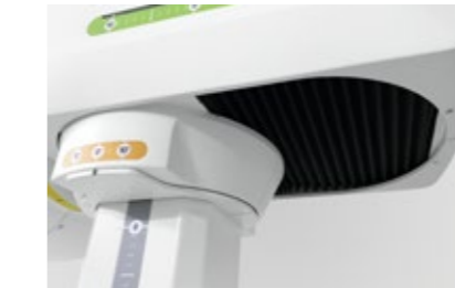
m) Fins below the horizontal unit of the C-arm

but is supplemented by the following activities (have the C-arm raised beforehand; see item i).