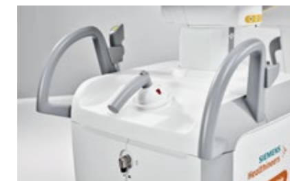
b) Mobile C-arm: handles