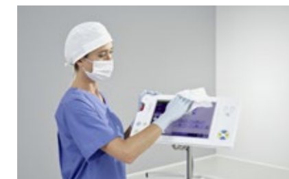
d) Mobile C-arm touch user interface/remote user interface