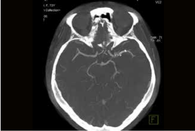
Figure 3: Axial MPR reconstruction showing X stent in the left middle cerebral artery

Siemens Healthineers Headquarters Siemens Healthcare GmbH Henkestr. 127 91052 Erlangen, Germany Phone: +49 9131 84-0 siemens-healthineers.com