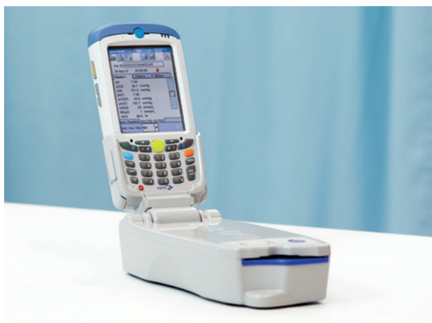
epoc Blood Analysis System

*Not available for sale in the U.S. Product availability varies by country.