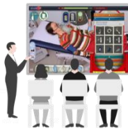
Classroom Education with abcdeSIM case scenarios

First, users have to acquire theoretical knowledge. In the e-learning part of abcdeSIM, all components are explained step by step. Each learning section has questions that users have to answer in order to move on to the next.