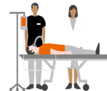
Actual patient care