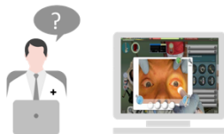
Self-study and practice with abcdeSIM serious gaming simulation