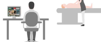
Practice in Simulation Lab. 1) with abcdeSIM