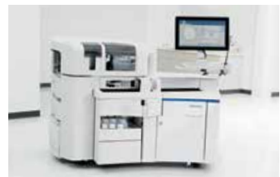
ADVIA Centaur XPT System