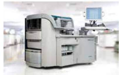
ADVIA Centaur XP System