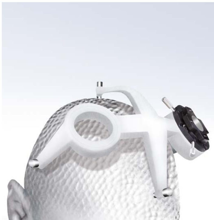
Stereotactic Platform, Material: PA 2201; Source: FHC, Inc.*