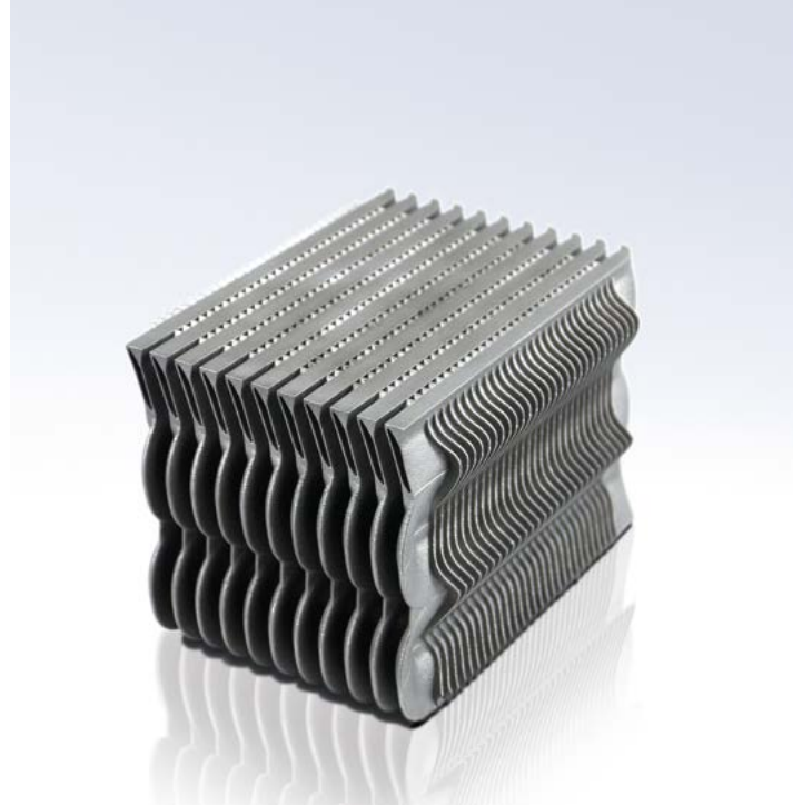
Heat Exchanger, Material: EOS Aluminium AlSi 10Mg; Source: 3T RPD, Autodesk Within, EOS

EOS offers a wide range of materials that can be used in many industries. The part properties are ensured from one system generation to the next. You can make flexible and optimum use of the EOS technology with DMLS® (Direct Metal Laser Sintering) for your specific applications. At the end of the day this means competitive advantages for you thanks to favourably priced high-end metal parts.