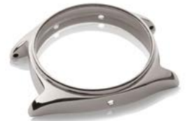
Watch Case, Material: EOS StainlessSteel 316L; Source: Cooksongold