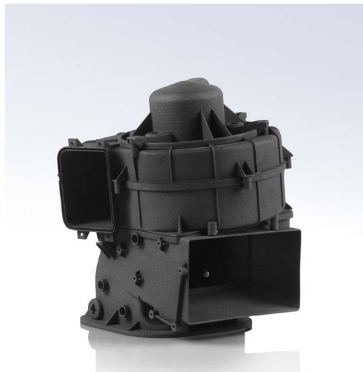
Housing, Material: PA 2202 black; Source: Valeo

EOS offers 16 materials for Additive Manufacturing with plastics, which meet a wide range of different component requirements: filled and unfilled polyamides (PA), thermoplastic elastomers (TPE), polyether ketone (PAEK) and polystyrene (PS). We provide advice and support to help you select the materials based on the property profiles required for your components.