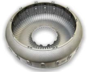
Combustor, Material: EOS NickelAlloy IN718

A database of the powder and part properties measured during the quality assurance process documents the performance capacity of the entire supply chain.