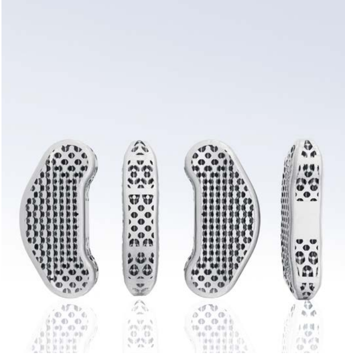
Spinal Implant, Material: Ti64ELI