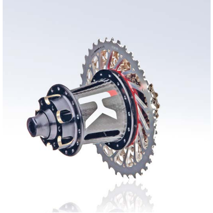
Rear Hub, Material: EOS MaragingSteel MS1; Source: Kappius Components

Discover the optimal materials that turn ideas into possibilities – and possibilities into results.